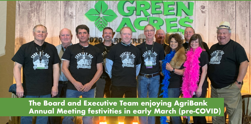
The Board and Executive Team enjoying AgriBank Annual Meeting festivities in early March (pre-COVID)